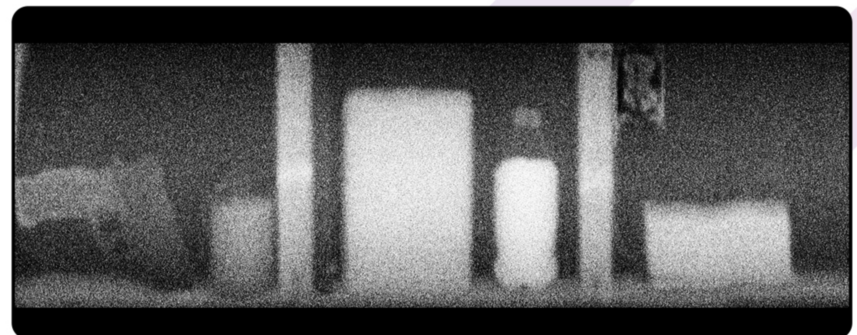
WALL - LEFT TO RIGHT: GUN, EXPLOSIVES, DRUGS, LIQUID, LISTENING DEVICE AND CASH DETECTED